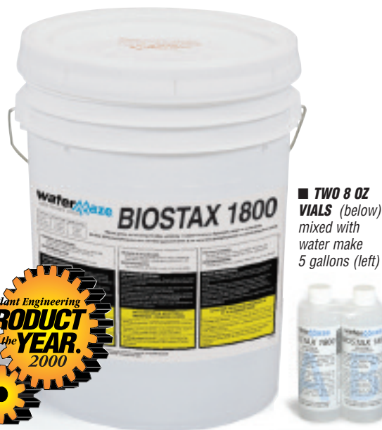
■ TWO 8 OZ VIALS (below) mixed with water make 5 gallons (left)

Important: BioStax 1800 must be kept refrigerated prior to use.