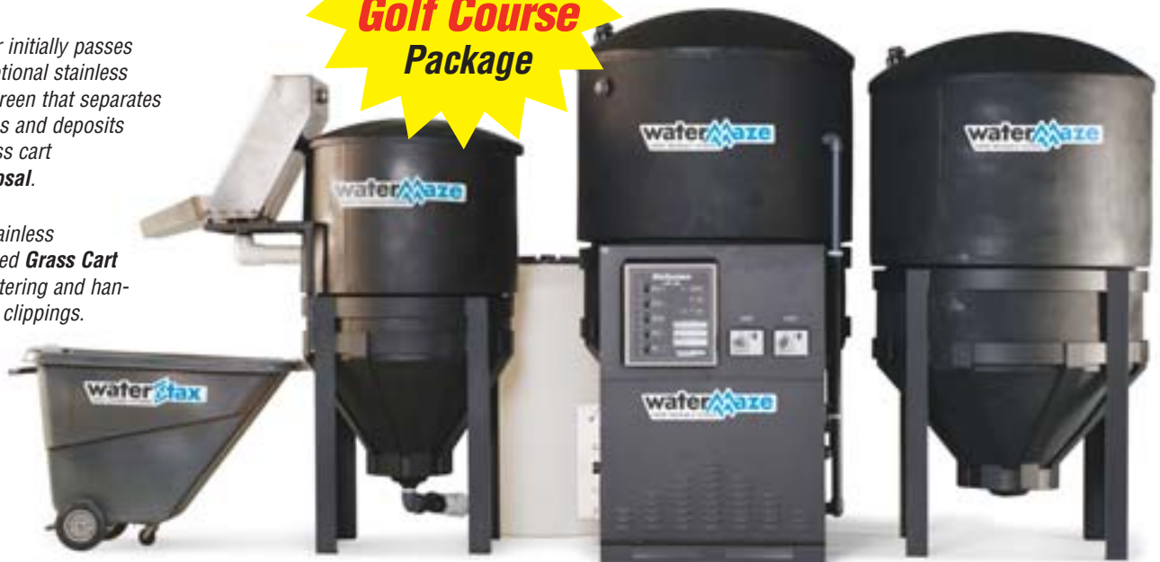
Optional cart for easy disposal of grass clippings

The CLB BioSystem is available with a WaterStax Golf Course package for treating wash-water with a high content of grass clippings and other greenery.